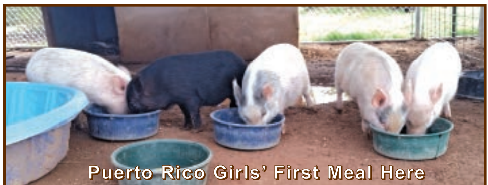
Puerto Rico Girls' First Meal Here