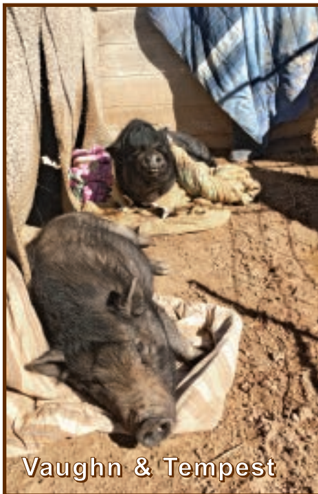
Vaughn & Tempest

extra blankets for the past couple of months with all of the rain we've been getting. A lot of the blankets will get wet and we need to hang them to dry then need dry blankets to replace them in the houses.