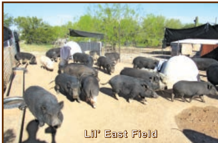
Lil' East Field

December of 2018. Sweet Cheeks had her first birthday last month while the sisters, Rosalie and Sugarfoot will turn one year old in July. Pot-bellied pigs don't reach their full adult size until 3 years of age, so there are many more youngsters that are growing up here. Pua, Nacho, Twizzler, Popcorn, Pooah and Wilbur are all 2019 arrivals that are not yet fully grown. The Lil' East Field is a field that was built specifically for