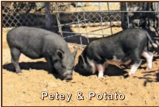
Petey & Potato

returning to the sanctuary, Petey was definitely feeling better. He was up and chatty, wanting to play. The bathroom was filled with quilts and toys for him, but he soon got bored and began a remodeling project that involved stripping the wallpaper. Uh oh! Now that Petey was feeling better and the days were a bit warmer, he began spending the majority of the day out in one of the holding pens as well as getting a couple of