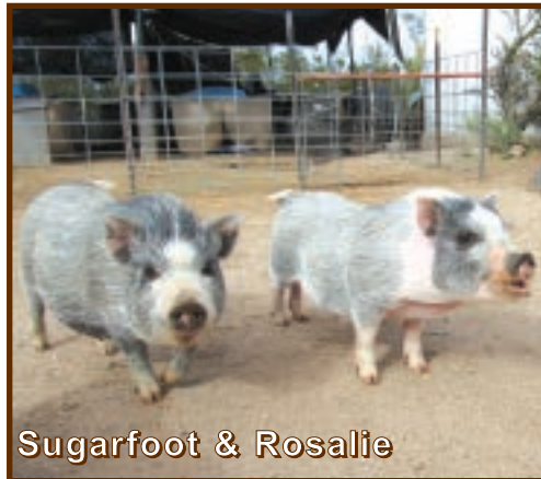
Sugarfoot &amp; Rosalie

Currently our youngest resident pigs are the group from Puerto Rico. (See page 10 for their story.) There are also 3 adorable girls that came here together in