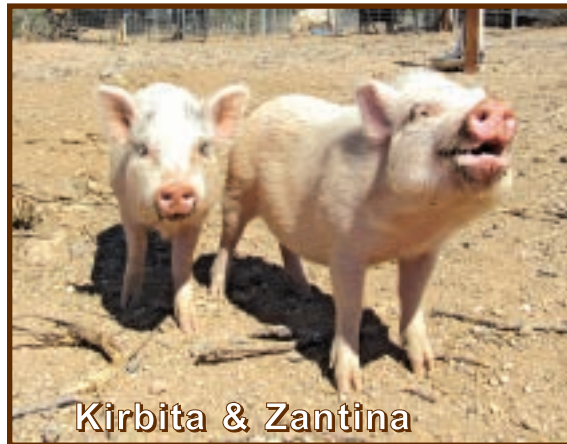
Kirbita &amp; Zantina

they are outside but after returning to the pen, the girls get a little defensive with poor Petey.