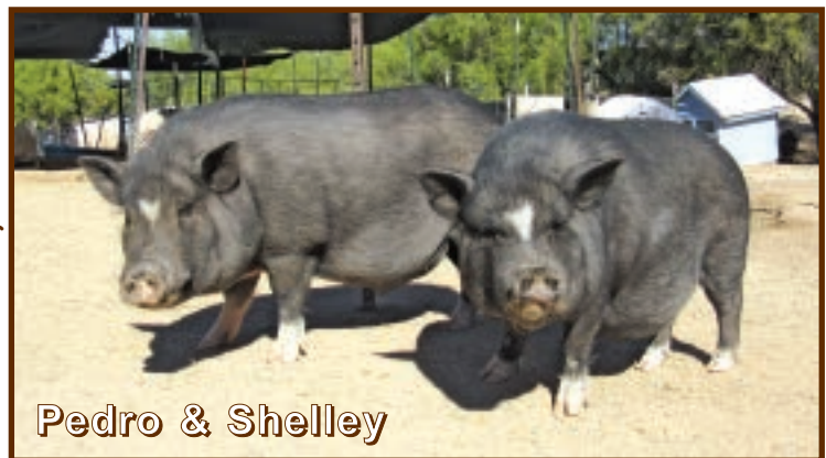
Pedro & Shelley

Please make all your purchases including your personal purchases on smile.amazon.com and designate the Ironwood Pig Sanctuary as your charity of choice. Log on to smile.amazon.com/ch/86-0999483 using the same log-in information that you use for your amazon.com account. At the top of the