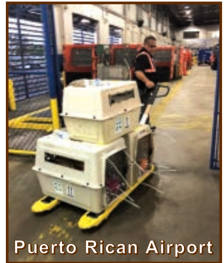
Puerto Rican Airport

While all this business with Petey was going on, we got word of a litter of 5 girls ready to fly out of Puerto Rico from the foster home where they were born. The hope was to get them into Arizona and