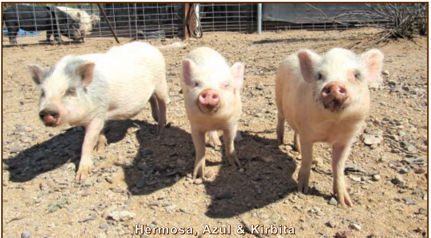
Hermosa, Azul & Kirbita