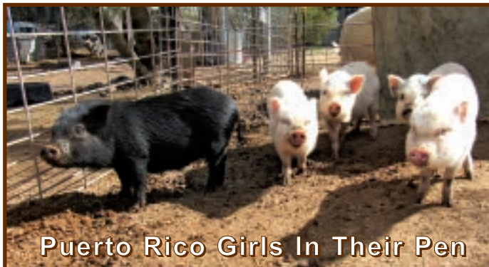
Puerto Rico Girls In Their Pen

When Hurricane Maria hit Puerto Rico in September 2017, it caused immense widespread damage. The clean up and recovery is still underway in many areas. Due to the complete devastation of houses, not only were countless people left homeless, but their pets which included pot-bellied pigs were also displaced and left running the streets. Over time this led to an overpopulation of stray pigs which is believed to have reached over 400. The USDA's answer to this rapidly increasing problem was to trap the pigs, take them to the local landfill and shoot them. Yes, shoot them! This inhumane statement brought a surge of people willing and able to come up with a better solution. One of those groups was Women United For Animal Welfare (WUFAW). They filed petitions asking the government to hold off on the killing and allow them time to formulate a humane plan. Thankfully, their efforts worked. The next step of the plan was acquiring a piece of land to use as a sanctuary for the pigs. Here they set up a spay/neuter program as well as a local and international adoption program. With that in place, the goal became capturing females first and spaying as many as possible. Some were too far along in their pregnancies and were placed in foster homes