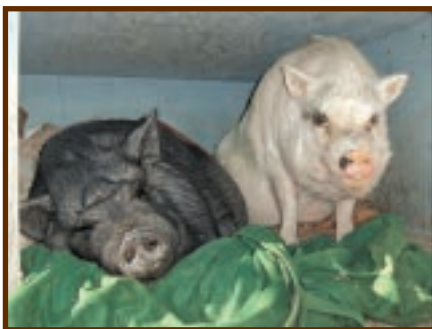
Ganesha and Govinda

Pegasus moved in behind my house first and soon to follow was Ganesha. We moved Govinda and Doppers into a pen since they were both due for cryo-