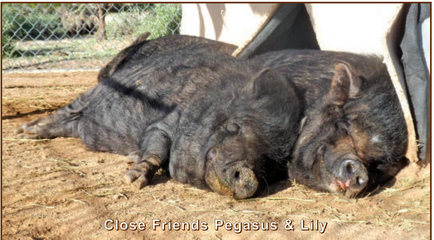
Close Friends Pegasus & Lily