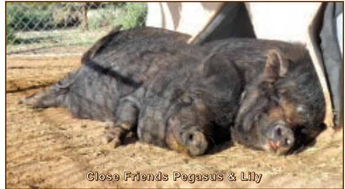
Close Friends Pegasus & Lily

surgery for their many skin cancers. Once they healed we decided it was time for them to live with some others more in their age group with similar