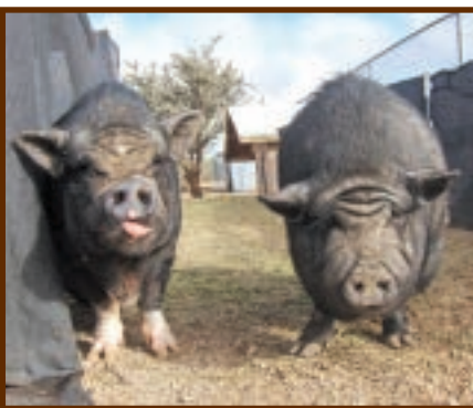
Lily and Pegasus

where we took in a total of 75 pigs over a few years. The rescue was doing poorly and in need of help. Many of the pigs have been featured in our