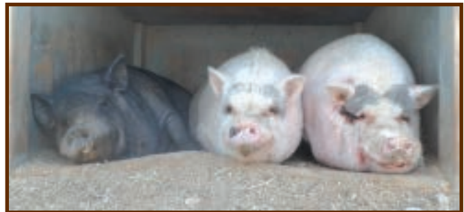
Ganesha, Govinda and Doppers

needs. However, they were still pretty mobile so they were given a larger area with pigs that were still better able to get around. Finally Lily was moving slower and slower so we brought her in to join her friends Pegasus and Ganesha.