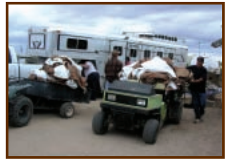
calling folks and e-mailing to make arrangements to move them out.