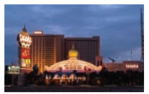
Sahara Hotel & Casino in Las Vegas