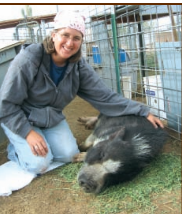
didn't have to compete for anything and he was just a few feet from his food bowl.

Within a few days he became a happier and more relaxed pig. One morning when I went in to clean his pen he looked up at me and I could see that he wanted attention. I started to pet his head and he rolled right over for a belly