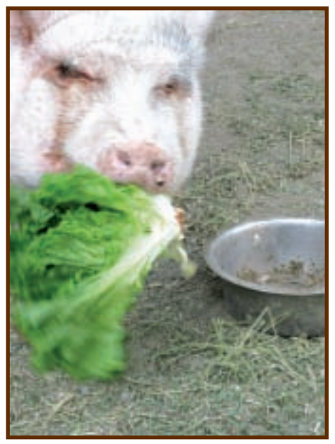
Pinky Loves Her Lettuce And Shakes It Back & Forth Like A Dog Might

space to bed down in the pig house. Strawberry still bullies Pinky, though Pinky has become more self-confident and harder to intimidate.