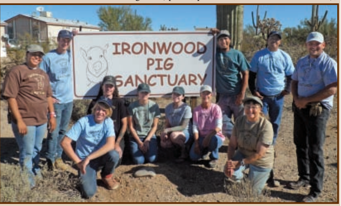
Our Staff Modeling The Ironwood T-Shirts & Hats

chocolate brown, sand, black, pale pink, candy pink, stonewashed blue, maroon, light blue and heather gray. Sizes range from youth small and medium. adult medium to XXL and ladies small to XXL. Send in your orders today by phone, email, PayPal or check. Show your support for the Ironwood Pig Sanctuary with these comfortable hats and tees!