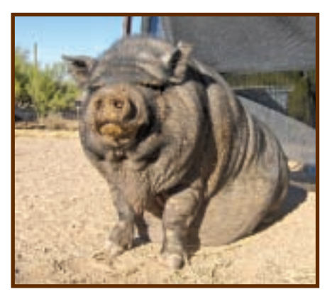
Elizabeth Is No Micro-Mini Pig

Pot-bellied pigs are sold under a number of names, but none of them are true or accurate. Breeders manufacture names such as "Dandy-Pigs," "Teacup-Pigs," "Thimble-Pigs," "Pocket-Pigs," "Pixy-Pigs," and "Micro-Minis" to help them sell. None of these names, conjured up to reflect a diminutive size, are true breeds of pig, nor do they accurately reflect the final size, needs, or behavior of the animal.