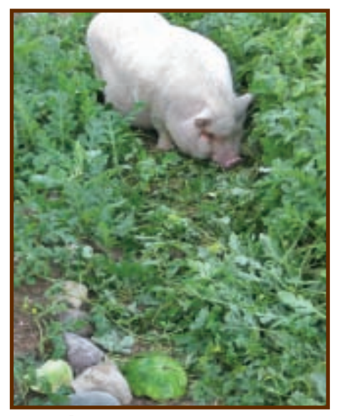
Pinky In The Melon Patch

In the last few months we've all mellowed and settled in to this living arrangement. There's still ample grunting each evening when the girls are jockeying for