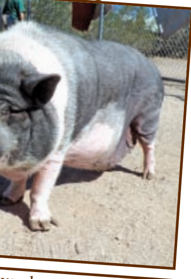
wood years ago and got m back and would love to e's sponsored pig. I'm a looking for a friend.