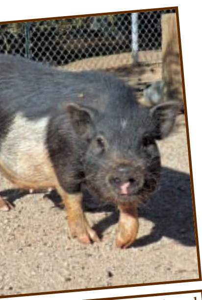
me is Nellie, I have a black and y. I'm not very smelly and have ched the telly. I'd love to visit a be eat some grape jelly. My not Kelly but will always be a da!