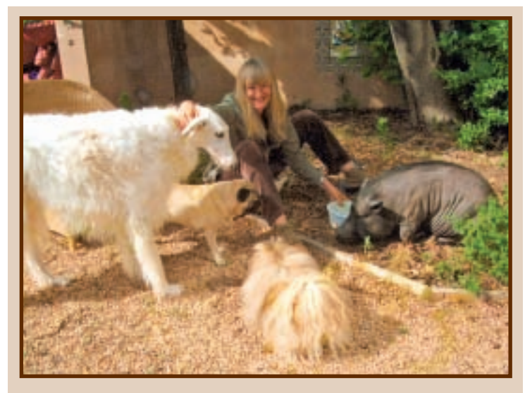
Dear Donna and Ben,

* The Ironwood Pig Sanctuary is a 501(c)(3) non-profit organization and your donations are tax deductible.