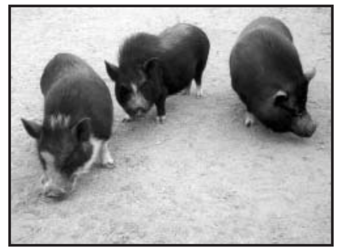
Roi, Delta and Sally

pigs in the past and currently have 4 staying with us for an extended period. All boarders have their own pen with shade, shelter and pools along with access