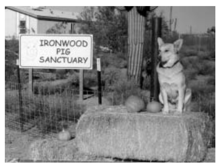
Aussie Greeting our Many Visitors

Anyone interested in these positions please call.