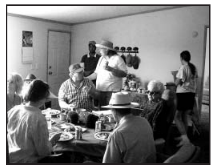
Visitors Enjoying our Vegetarian Lunch

soaking up all the attention and love was beyond words. All of the staff and volunteers noticed the remarkable change almost immediately. The pigs knew that EVERYONE was there for them. We had visitors from California, northern Arizona, New Mexico, and points in between.