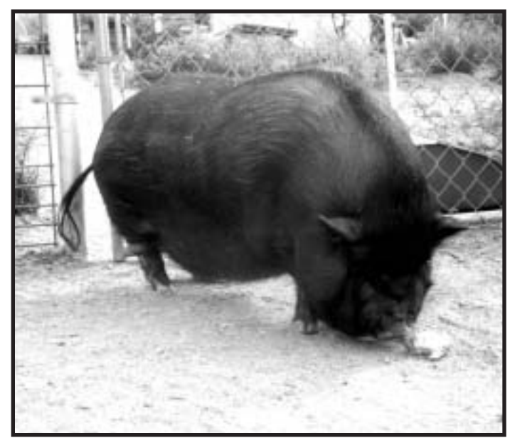
Phoebe in the Exercise Yard

to the exercise yard where they have plenty of room to explore their surroundings. These boarders have not only found their way to Ironwood but also found their way into our hearts! If you or someone you know needs to board a pig for a few days or for a longer period of time, please give us a call.