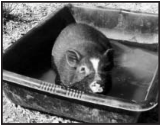
Spike Cooling Off

need for comfort is also for their safety. They need to keep warm in winter and cool in summer. Pigs do not sweat and have no way to dissipate the extra body heat from their bodies. Therefore, they need wading pools and mud wallows and plenty of shade. In the winter they will seek out the sunny places to warm their bodies and nest at night in their blankets and shelters. We provide wood chips and many blankets for nesting and carpet doors for their shelters. And of course they love the comfort of each other. So if you have a pig as a companion please be sure you provide plenty of shade, shelter, water and when possible company. They need all of these things for their well being and safety.