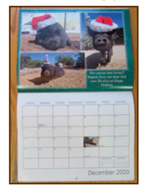
2020 Ironwood Calendar $15 different pigs featured each month