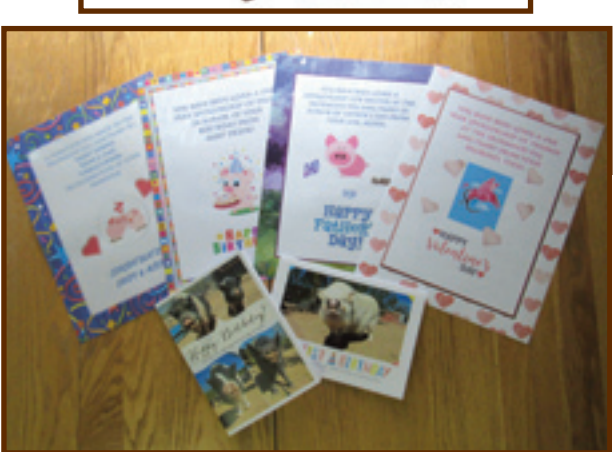
Donations "In Honor Of" $ at your discretion; get a certificate or card of acknowledgement