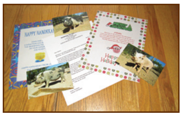
Sponsor a Pig - $30 monthly get a letter and pictures of an adorable pig

You may purchase these gifts using the enclosed envelope or go to Ironwood's web site and use PayPal or your credit card. Please note that the T-shirts, hats and aprons are ONLY available online and need plenty of advance notice .