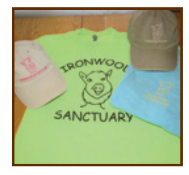
T-Shirts, Hats & Aprons with the Ironwood logo, are available ONLY at www.ironwoodpigs.org on the Support Page or when visiting the sanctuary