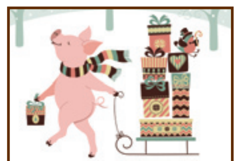
Jigsaw Puzzles - $23 252 piece puzzles of Ironwood pigs